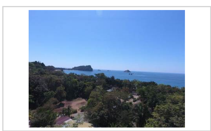
Information is deemed to be correct but not guaranteed.