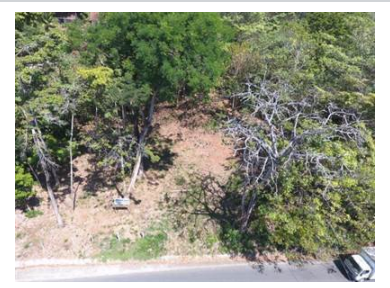
• Type: Lots and Land • Style: Single Story