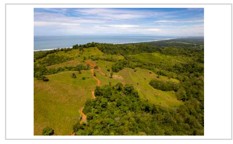
Information is deemed to be correct but not guaranteed.