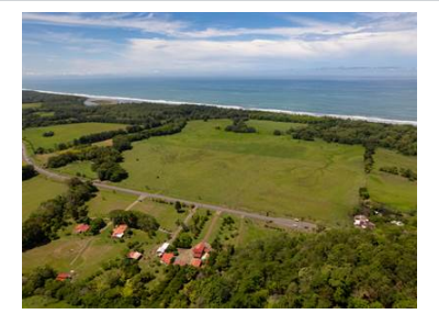
• Type: Farm and Ranch • Style: Lot / Land